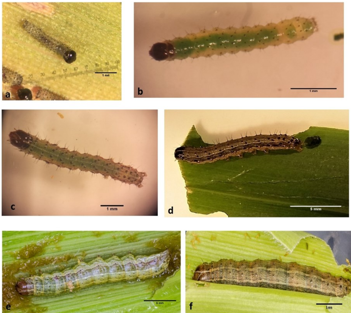
Figure 2: The six larval instar stages of Spodoptera frugiperda . a – First instar; b – Second instar; c – Third instar; d – Fourth instar; e – Fifth instar; f – Sixth instar