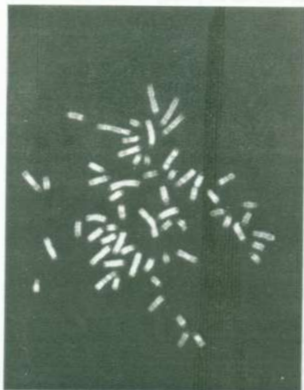
Fig.1. Q-banded diploid cell ( 2n=60 ).

Chromosome preparations were allowed to age for 2-3 days at 5°C in a refrigerator and then stained with 0.005 % Quinacrine mustard solution dissolved in distilled water for 25-35 sec. and were thoroughly rinsed with double-distilled water. Sorenson's buffer (pH = 6.8) was applied on to the stained slides and each slide was covered with a glass coverslip. Metaphases were observed under fluorescence microscope and photographed using a Kodak Pan technical film. Chromosomes were arranged to prepare a karyotype according to ISCNA recommendation (ISCNA 1989). Idiogram was constructed for Q-bands, most prominent land marks and regions were defined and bands were numbered. The numbering of regions and bands was based on ISCNA (1989).